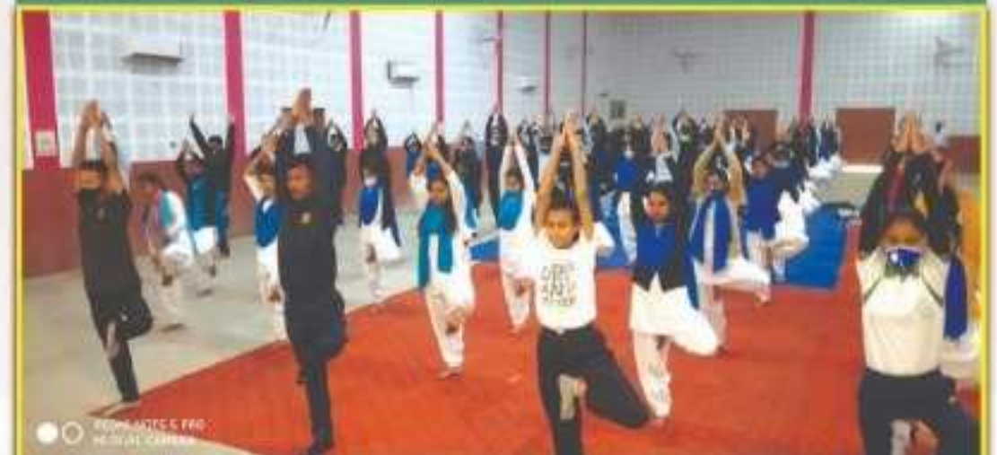
Workshop on yoga was organised by IQAC and Students' Union of ADP College on 10th December, 2020