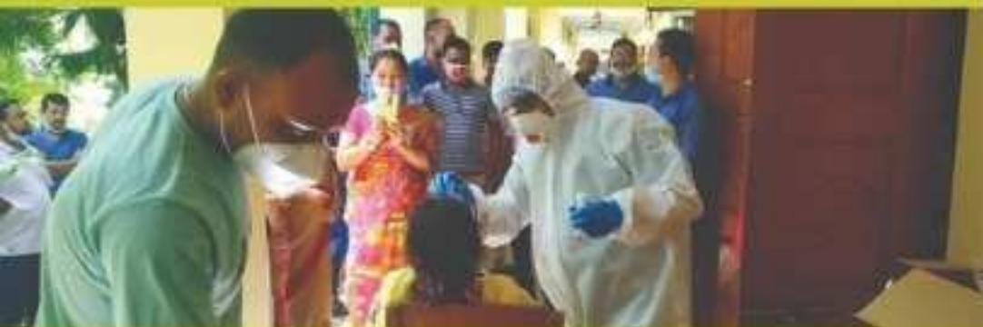
The College Organized Rapid Antigen Test (RAT) and Health Screening Camps for Students and Staff on 24/08/2020, 27/11/2020 and 1/12/2020 respectively