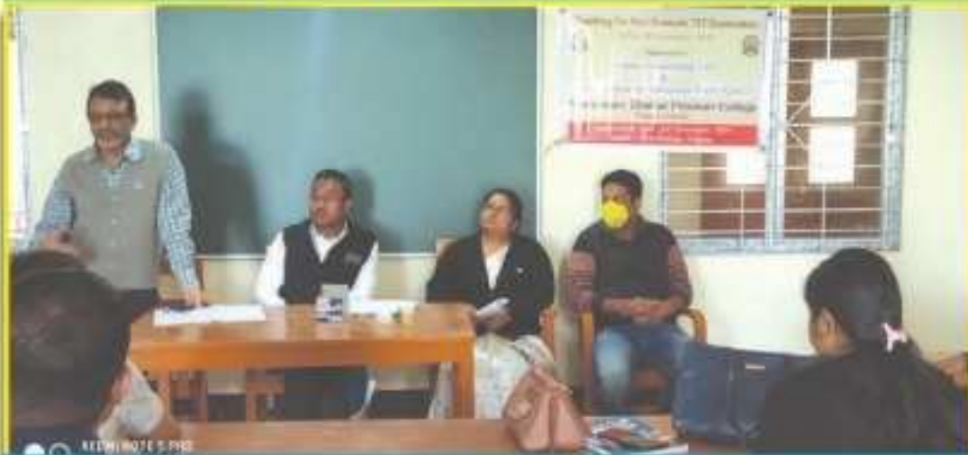
Training Programme for TET Examination was Conducted for Students and Alumni of ADP College from 14th December to 28th December, 2020