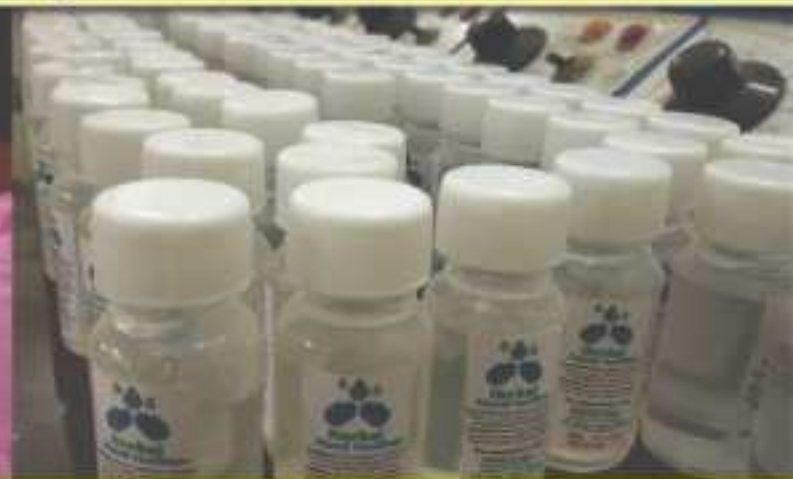
Two varieties of hand sanitizer were prepared by the Herbal Science and Technology Department of ADP College. The product was distributed among college staff, adopted village, surrounding communities and various Government Organisations such as SBI Nagaon etc.