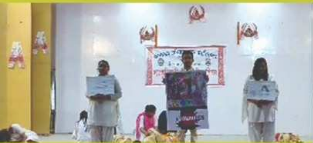
Department of Geography performed an awareness Skit on Corona Virus in February, 2020