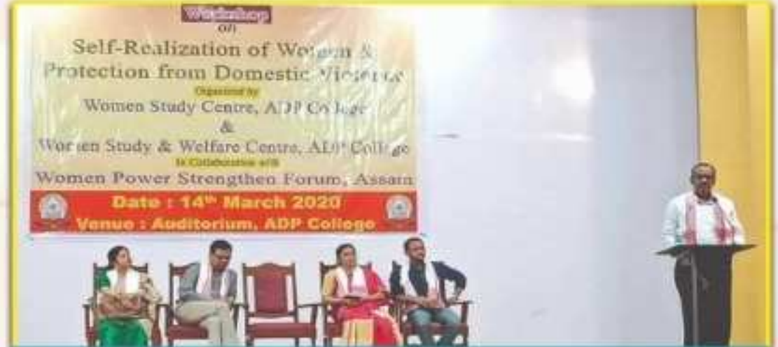
Workshop on Self-Realization of Women & Protection from Domestic Violence